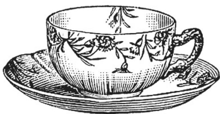
*The other kind